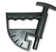
Manual Drop Center Tool (PN 8435685)