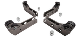
Grip-Max® Plus 28" Clamps (PN 85607986)