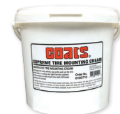
Paste Lube Bucket (PN 8183710)