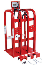
EL-X Express Lane® Inflation System (PN 85607770)