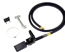
Auxiliary Bead Sealer (ABS) (PN 85606545)