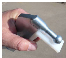
#12488 Wheel Protector (Mounting)