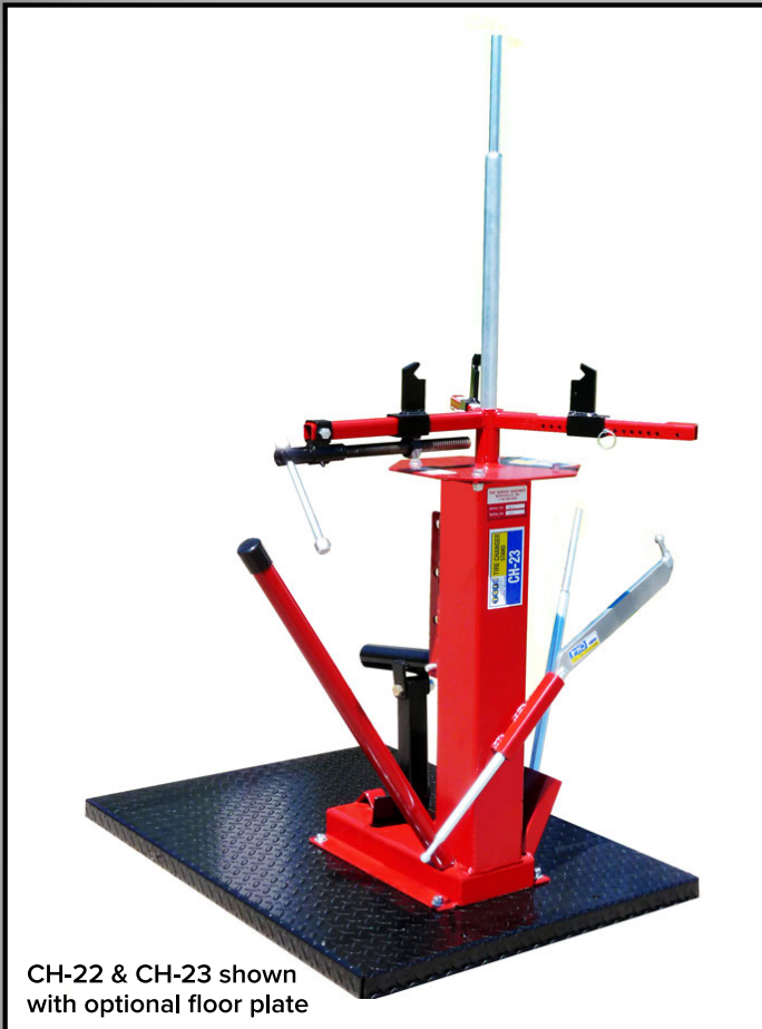
CH-22 & CH-23 shown with optional floor plate