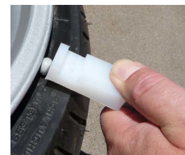
#12488 Wheel Protector (Demounting)