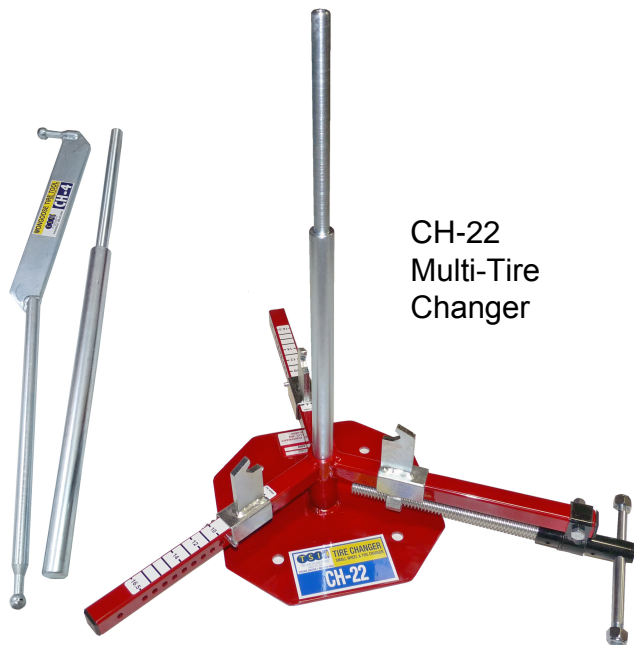
CH-22 Multi-Tire Changer