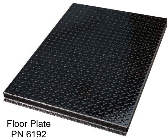
Floor Plate PN 6192