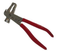
Weight Hammer 301400425