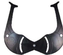
Rim Width Gauge 46FC77653