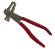
Weight Hammer 301400425