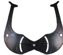
Rim Width Gauge 46FC77653