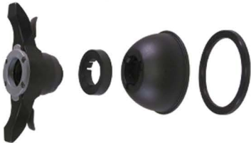
Manual Locking Kit 41FF83148

Standard Accessories: ER75MC (Manual Locking) and ER75AC (Pneumatic Locking)